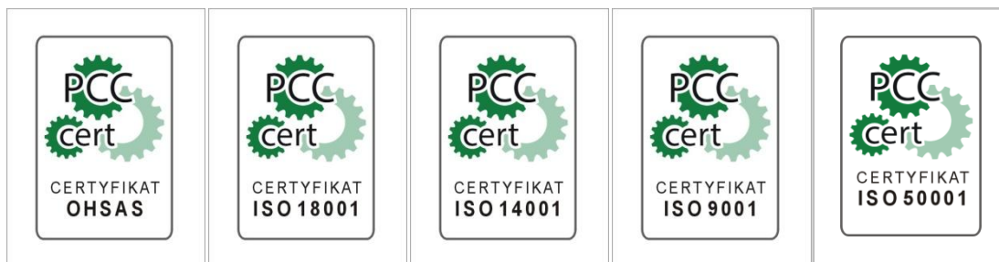
Figure 1. Template of PCC certification mark (depending on management system).

The organization can present the certification mark (applicable for management system) in compliance with the following principles.