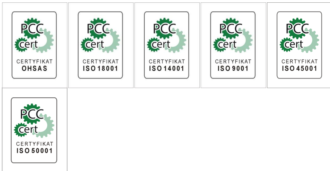
Figure 1. Template of PCC certification mark (depending on management system).

The organization can present the certification mark (applicable for management system) in compliance with the following principles.