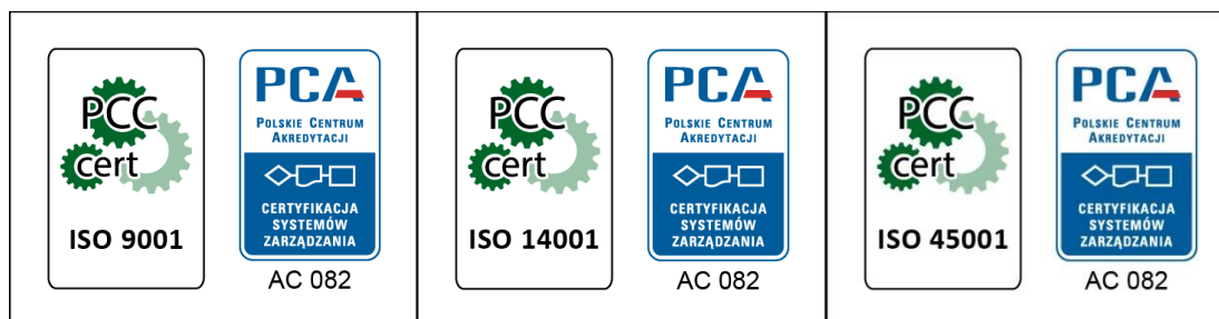
Figure 2. Template of PCC certification mark in combination with PCA accreditation symbol (depending of management system).

The organization can present the PCC certification mark in combination with the PCA accreditation symbol (applicable for management system) in compliance with the following principles.